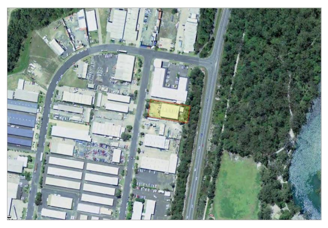
Figure 1: Subject land - Lot 3 DP 735083, Craft Close, Toormina

The planning proposal affects a single piece of private property in the Coffs Harbour LGA described as Lot 3 DP 735083 located at number 5 Craft Close, Toormina (Figure 1). This locality is known locally as the Hi Tech Industrial Estate. The estate is located approximately 6 kilometres south of the Coffs Harbour city centre and 1.4 kilometres north of the Toormina shopping centre.