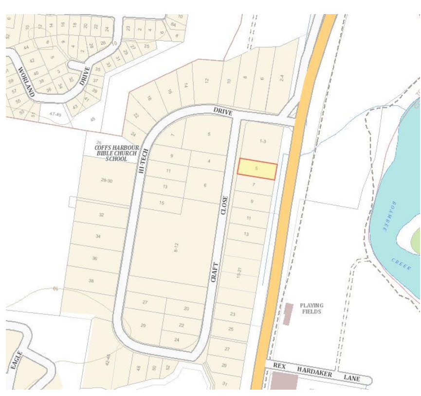
FIGURE 1 – Subject land

The subject land has an area of approximately 2110m<sup>2</sup> with 28metres frontage to Craft Close. It backs onto a vegetated buffer strip used to prohibit access to Hogbin Drive on the eastern side of the land. It contains a large industrial shed with a footprint of approximately 720m<sup>2</sup> that is sufficiently tall to accommodate a mezzanine level. The balance of the site is used for open-air play equipment, and on-site parking for cars and buses. The site is fully fenced and has a single driveway to access Craft Close. The current zoning under Coffs Harbour LEP 2013 is IN1 General Industrial as shown in Figure 2.