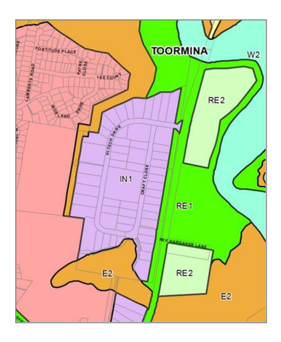
FIGURE 2 – Existing Zones under Coffs Harbour LEP 2013.

The subject land has an area of approximately 2110m<sup>2</sup> with 28metres frontage to Craft Close. It backs onto a vegetated buffer strip used to prohibit access to Hogbin Drive on the eastern side of the land. It contains a large industrial shed with a footprint of approximately 720m<sup>2</sup> that is sufficiently tall to accommodate a mezzanine level. The balance of the site is used for open-air play equipment, and on-site parking for cars and buses. The site is fully fenced and has a single driveway to access Craft Close. The current zoning under Coffs Harbour LEP 2013 is IN1 General Industrial as shown in Figure 2.